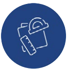
Plate Heat Exchanger Redesign and Rebuild

Worried about contamination and food safety? Minimise the risks of cross contamination and ensure you meet Dairy and Food Safety Standards with our Gas Integrity Testing, Holding Time Tube Test, Hydrostatic Testing, and Non-Destructive Testing (NDT) for Clean and Crack Testing.